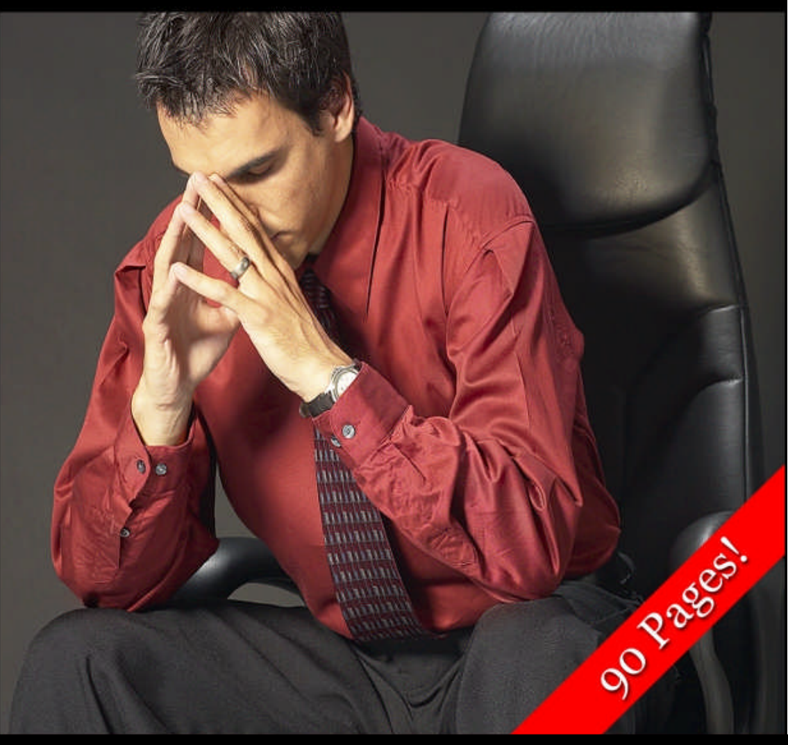
Brought to you by Chools